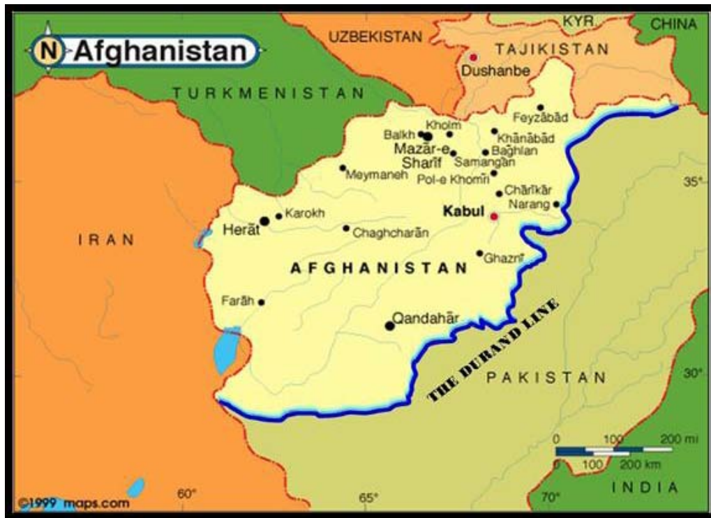
Map 2: The Durand Line demarcates the Pak-Afghan Border