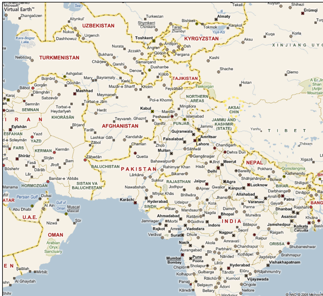
Map 1: Pakistan at the crossroads of Central Asia, South Asia and the Middle East