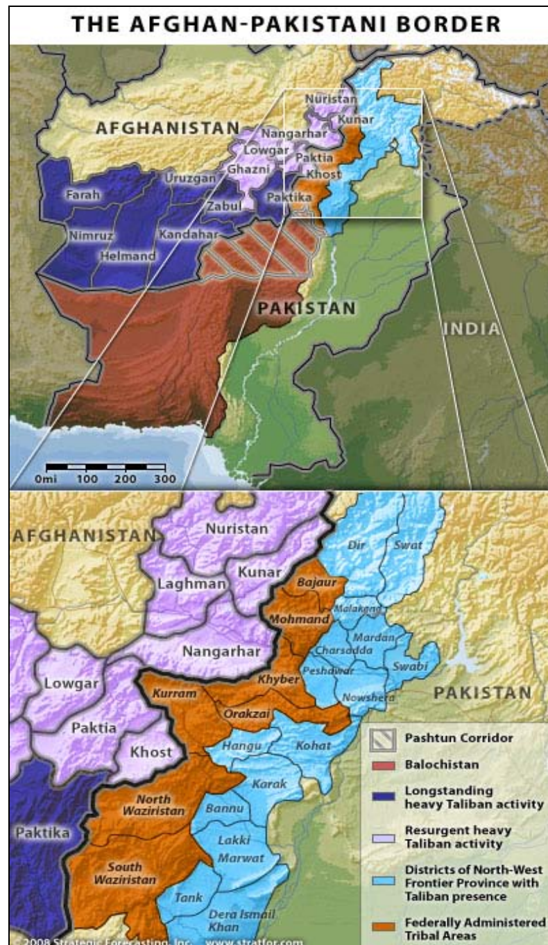
Map 5: Areas where the Taliban are more active (see box)